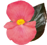
Rose Bronze Leaf BB0205P