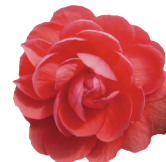
Salmon Pink BT0802P