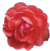
Salmon Pink BT0802P