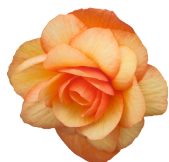
Apricot Shades BT0803P