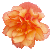
Golden Picotee BT0801P