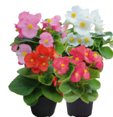
Mix (excl. Blush) BS0499P