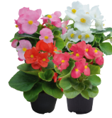
Mix (excl. Blush) BS0499P