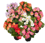
Maxi Mix BS0299P