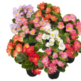
Maxi Mix BS0299P