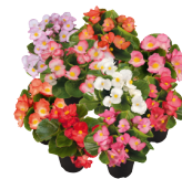
Maxi Mix BS0299P