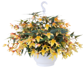
Mellow Yellow BB5107P