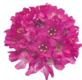
Deep Rose AM2001R